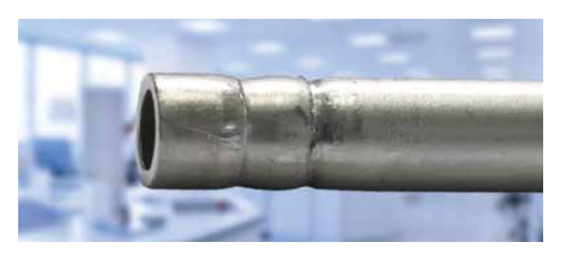
DAMAGED STEMS CAN BE COSTLY!

Have you noticed that Graphite Vespel™ ferrules always seem to want to slide off? A dirty floor can also contaminate the ferrule thereby jeopardizing your sample.