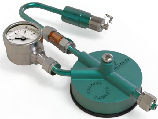
CS1200ES Silonite™ Coated Passive Canister Sampler