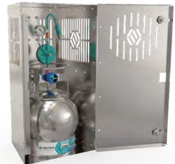
6L Can Secure Enclosure PN: 29-CANSTATION

Nickel ferrules have the strength and reliability of stainless steel ferrules, but are removeable/replaceable, so they protect your investment.