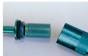
Replacement Silonite Filter and O-Ring – PN: 39-92150