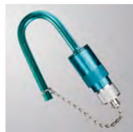
Silonite™ Filter Inlet Kit w/ Rain Guard – PN: 39-92204S

Untreated 300 series stainless steel is 67–70% iron, which is very reactive toward many TO-15A compounds. In addition, untreated stainless tubing has an internal oxide layer that readily adsorbs polar and heavier VOCs. The standard CS1200E inlet now comes internally polished, passivated, and Silonite™ coated to insure maximum recovery of all target compounds – virtually eliminating losses and carryover. The Silonite™ coated filter is placed on the inlet to completely eliminate dust and particulate intrusion during sampling. No need to worry about debris or anything including “insects” in the inlet tubing, a concern specifically mentioned in TO-15A when filters are not placed at the very inlet to the sample train. The inlet is capped off to avoid any contamination risk during shipping.