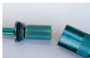
Replacement Silonite Filter and O-Ring – PN: 39-92150