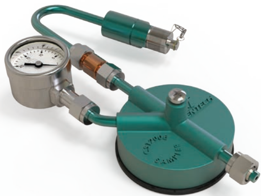
CS1200ES Silonite™ Coated Passive Canister Sampler