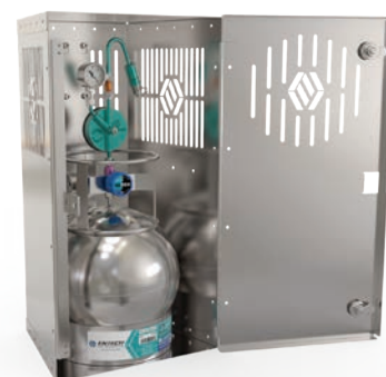
6L Can Secure Enclosure PN: 29-CANSTATION

Nickel ferrules have the strength and reliability of stainless steel ferrules, but are removeable/replaceable, so they protect your investment.