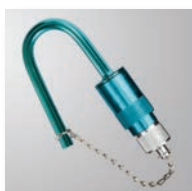
Silonite™ Filter Inlet Kit w/ Rain Guard – PN: 39-92204S

Untreated 300 series stainless steel is 67–70% iron, which is very reactive toward many TO-15A compounds. In addition, untreated stainless tubing has an internal oxide layer that readily adsorbs polar and heavier VOCs. The standard CS1200E inlet now comes internally polished, passivated, and Silonite™ coated to insure maximum recovery of all target compounds – virtually eliminating losses and carryover. The Silonite™ coated filter is placed on the inlet to completely eliminate dust and particulate intrusion during sampling. No need to worry about debris or anything including “insects” in the inlet tubing, a concern specifically mentioned in TO-15A when filters are not placed at the very inlet to the sample train. The inlet is capped off to avoid any contamination risk during shipping.