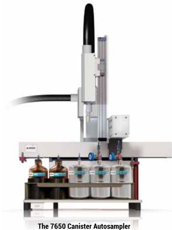
The 7650 Canister Autosampler