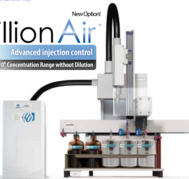
The 7200 Preconcentrator and 7650 Canister Autosampler

New Option! MillionAir™ Advanced injection control 10 6 Concentration Range without Dilution