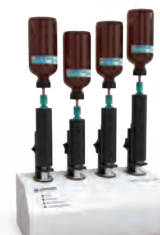
5400B Thermal Transfer System

The Recognized Global Leaders in Environmental Air Analysis.