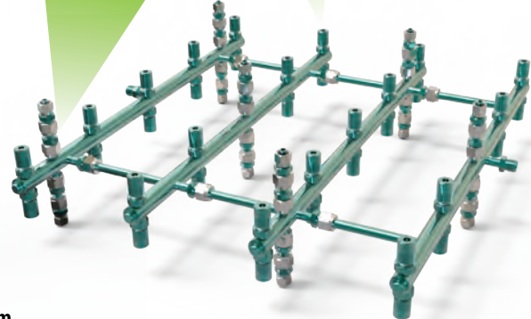
New Micro-QT™ Quick Connect Manifolds