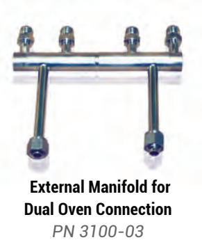
External Manifold for Dual Oven Connection PN 3100-03