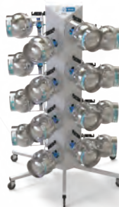
7016D Canister Autosampler