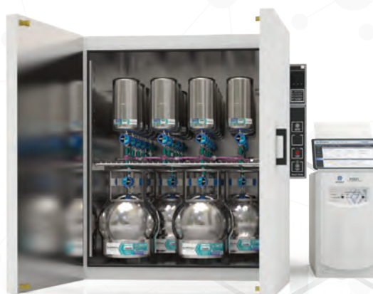
3112D Canister Cleaning System

3112D Canister Cleaning System –210628-9.0