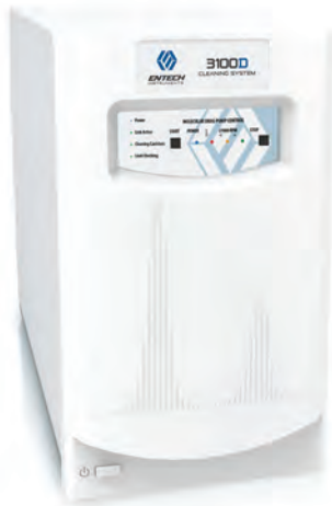
3100D Canister Cleaner

Superior oil-free canister cleaning systems for high throughput laboratories.