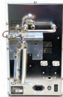
3100D Humidifier PN 07-10531