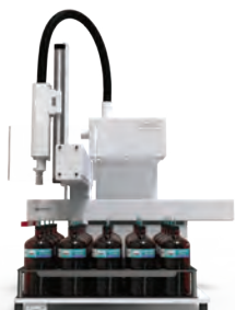
7650-L20 GC Gas Autosampler