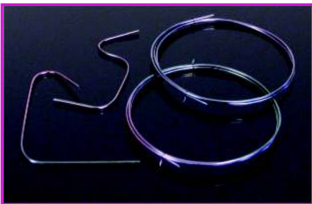
Silonite® Coated Cut Tubing

Small lengths of tubing can be coated on both the inside and outside for use in sampling systems and analyzers.