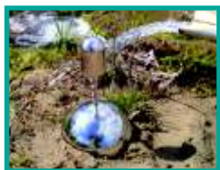
Solvent Enhancement Enclosure (SEE)