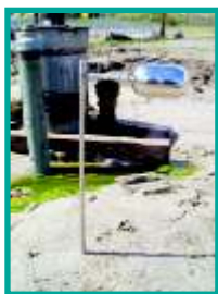
1M Soil Probe & 29-MC400L