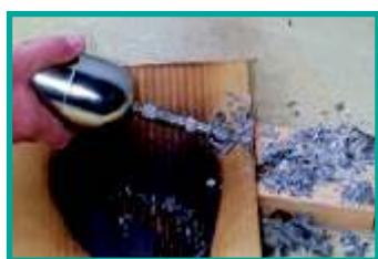
Vapors can be sampled directly once a positive canine response is obtained.