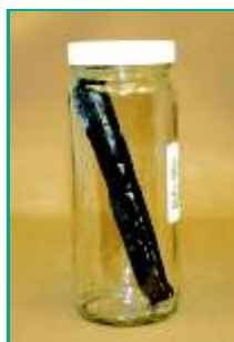
LVH samplers allow accelerants to be analyzed from debris in minutes rather than the 12-24 hours required for classical charcoal strip passive transfer and solvent extraction, with 10 to 1000 times greater sensitivity!

Analyzing individual pieces of debris for accelerants can also be done by placing the debris into low-cost, analytical grade LVH vials (Large Volume Headspace) rather than using paint cans that may adversely affect the sample. Direct analysis of the headspace can be performed in a fraction of the time needed to perform the "passive adsorbent transfer" technique more commonly used (see Page 47). LVH vials can also be used to collect carbon soot-covered window glass, as the deposited soot will start adsorbing the accelerant immediately after the fire is extinguished and temperatures return to ambient levels. When combined with on-site GC/FID(MS) operating out of a small mobile lab, the MiniCan and LVH samplers can provide results immediately while a potential crime scene is still secure.