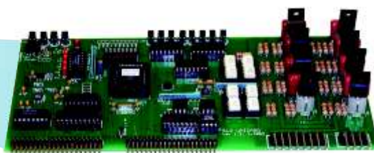
SmartLab 2™ “Universal Control Card” or UNICARD 2

SmartLab 2™ is a USB based instrument control platform developed by Entech. The SL2 network allows all Entech instruments to communicate with a single Windows® 2000 or XP computer in the laboratory. The “plug-in” control electronics are the same for each instrument, which simplifies the understanding and maintenance of Entech products. SmartLab 2 is an enhanced version of SmartLab 1 introduced by Entech in 1994, with improved features to further reduce instrument difficulties and downtime.