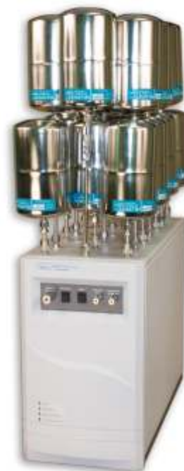
7032AQ-L with 21 MC1400 MiniCan canisters connected using alternating expansions to accommodate the larger 1400cc MiniCans.